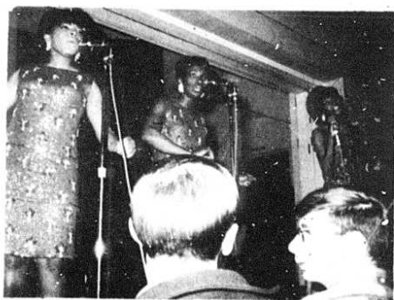
Martha & The Vandellas really belted it out.