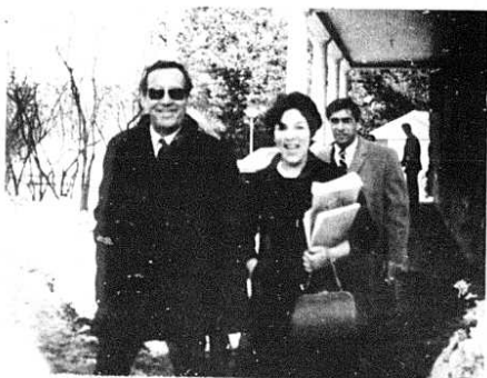
"Loquacious" Jean Shepherd arrives.