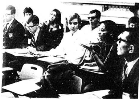
Reaction sessions gave delegates an opportunity to express their opinions on speakers' topics.