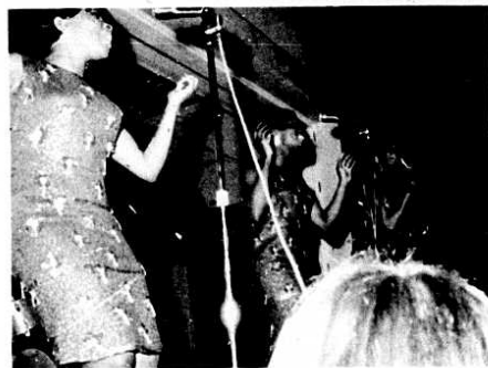
Martha and the Vandellas climaxed the entire weekend with a double concert before an overflow crowd in the Recreation Building on Saturday night.