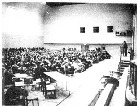
"Ya see, Moses had this P-R man who told him....."