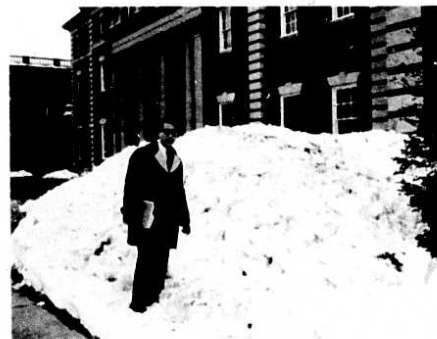
Guess what it did last week???