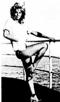
SEA VIEW... French beauty Mylene Demongot poses on shipboard during filming of recent movie.